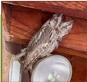
Western Screech Owl

Mission Statement -- Friends and neighbors coming together to improve their neighborhood community through sharing and cooperation, keeping in touch, and communicating their needs, wants, abilities and available services.