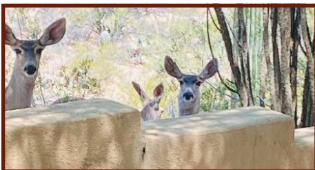
Family of Mule Deer

The next scheduled Board meeting is set for September 16th.