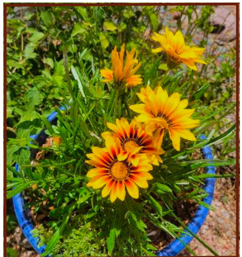
Blanket Flower