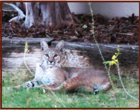
Bobcat relaxing