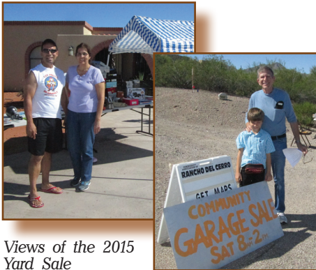
Views of the 2015 Yard Sale

We held our Annual Yard sale on October 24th 2015 and had 10 families participate. Those that participated said it went fairly well. Assuming we have 10 or more